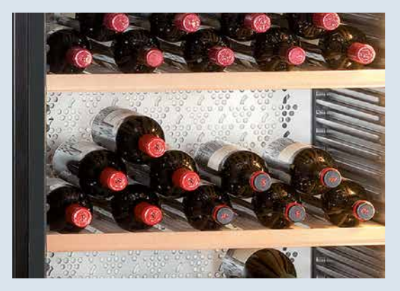
Wooden shelves: The wooden shelves are ideal for storing Bordeaux bottles. They can be stored in opposite directions to make full use of the capacity.

The WKb 4611 wine cabinet mimics the conditions of an underground wine cellar. Its solid door creates a dark, undisturbed environment with zero exposure to UV light and heat fluctuations – perfect for maturing wines. This unit ensures a constant interior temperature, which can be adjusted between +5 °C and +20 °C. Wines are always stored safely on our untreated wooden shelves while the activated charcoal filter provides optimal air quality.