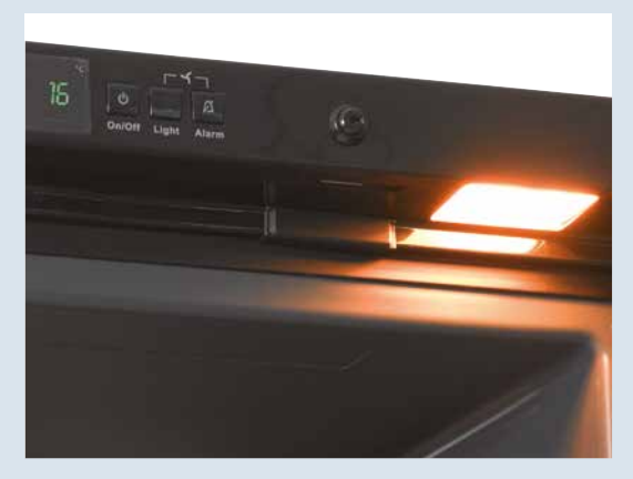
Integrated lock: Integrated in the front control panel for easy access, this sturdy lock protects your fine wine collection.

Optimum humidity: Liebherr wine cabinets guarantee an optimum humidity and this ensured the corks are supple in place whilst still allowing the wine to breathe in its maturing process.